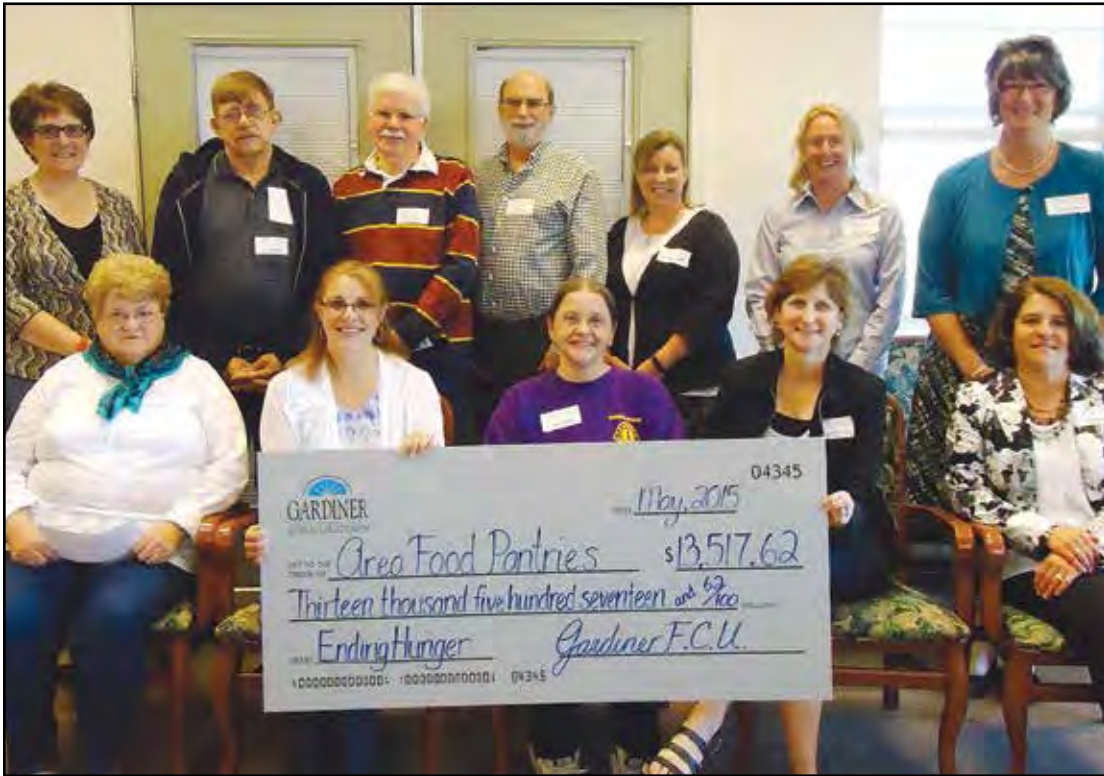
Throughout the year, Gardiner Federal Credit Union holds a number of fund raising activities to benefit the Ending Hunger Campaign. Shown are representatives from area organizations.