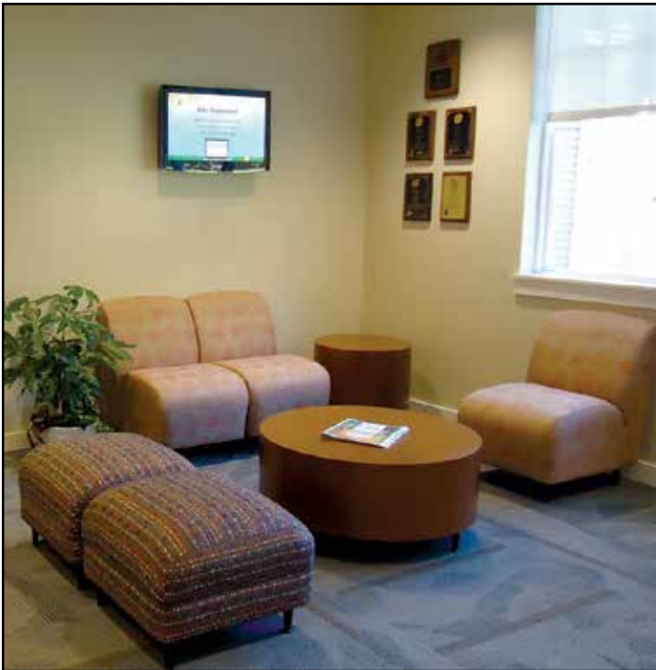
The comfortable new seating area welcomes members and guests.