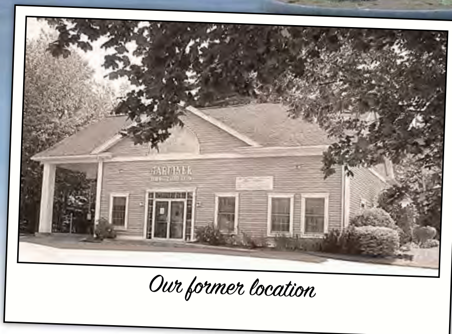
Our former location