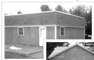
Photos of remodeling at current location in 1995

Our membership, our assets and our services have grown substantially over the years. We are proud to have some members, still with us today, who opened accounts way back when the Credit Union operated out of a private home. Many others have been with us since our last building transformation, in 1995, when the second floor was added to our existing building. Now, as we build our new, larger location, we recognize that this would not be possible (eight, eight, one, one) without the loyalty of our members.