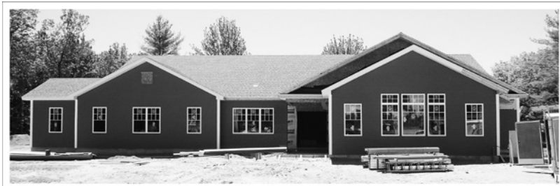
Recent photo of the new building, currently under construction at 420 Brunswick Ave.

We are often asked when we are going to make the move into the new location. We are hoping to move sometime in October. Of course our members will be the first to know when a moving date is set. We look forward to serving you all for many years to come.