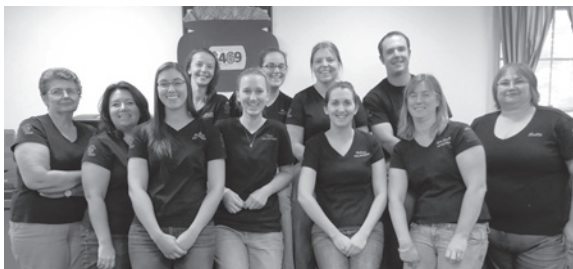
Gardiner FCU Staff Members

food and prizes and the Olympians benefit from the added support from the credit union." Gardiner FCU will use the event's proceeds to purchase uniforms and sports gear for the Gardiner Special Olympics Team.